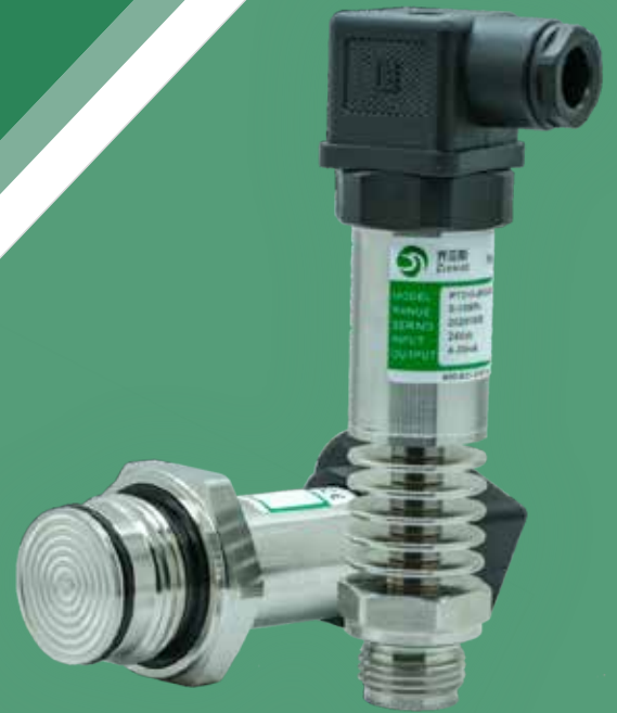
Industrial pressure sensor

Sensors, Internet of things and industrial automation systems